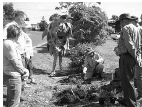
Woody at the Coles Bay Weedbuster Event

resources are directed into controlling this pest species before it spreads further. (one plants can produce up to 50 000 seeds!). The fantastic effort of volunteers during Weedbuster Week was a vital part of this process.