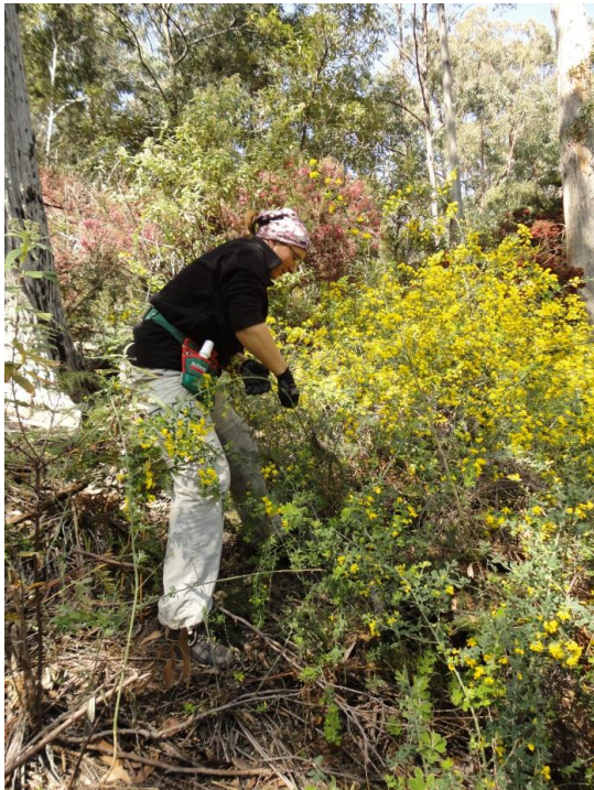
"Ripping out the Canary Broom, Friends of Maria Island Project"

The community's capacity to tackle major weed control works is inspiring with the Friends of Bass Strait Islands undaunted in their aim of eradicating African boxthorn ( the most recalcitrant, ferocious weed ever known), from Roydon Island, a very important bird colony site. Killora and Dennes Point Coastcare Groups are also taking on the incredible role of controlling boneseed on a very rugged, cliff lined, coast on the Channel side of North Bruny I. With the excellent work of abseiling weed contractors, Regnans, these Coastcare groups are well on the way to the word "eradicated".